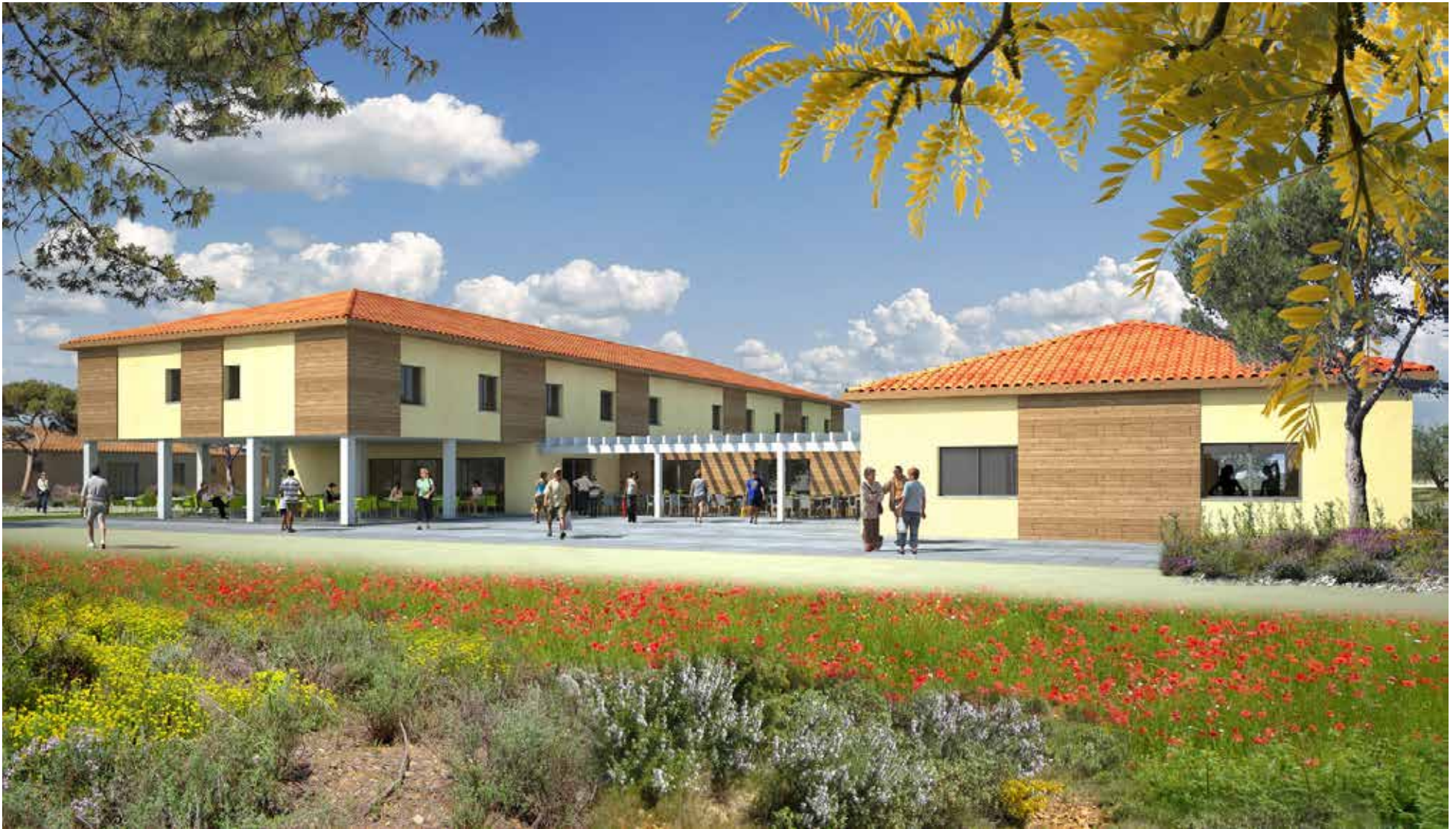
HOTEL & CENTRE